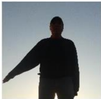
Canopy Down (CD)