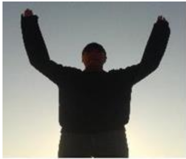
Missed Entry (ME)