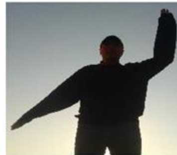
ACC Zone-down (DN)