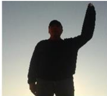
Vertical Extension (VE) No Water Drag (NW)