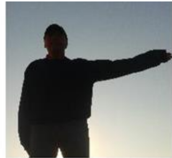
Out of Course Landing (OC) Out of Course Flying (OF)